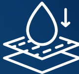
Reverse Osmosis Membrane

Reduces chlorine, chemicals, and pesticides.