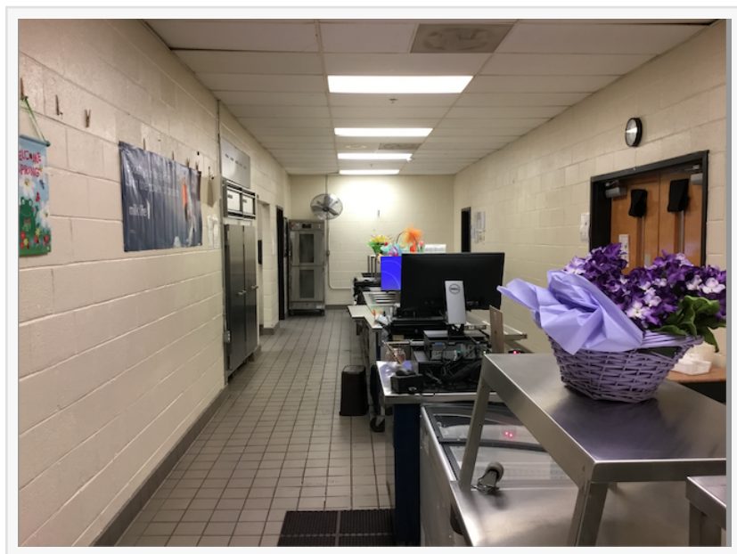
Is it a school or a prison, no visual difference - Before

MARIETTA, GA, USA, June 5, 2023 /EINPresswire.com/ -- BrandArmor® began installations of its ISO labcertified SafeWalls® antimicrobial wall covering in Cobb County Elementary Schools food service areas as a special collaboration with the Cobb County School District Food and Nutrition Services. This collaboration provides an attractive, fun environment for children, protects them from illness, and makes it easy for cafeteria