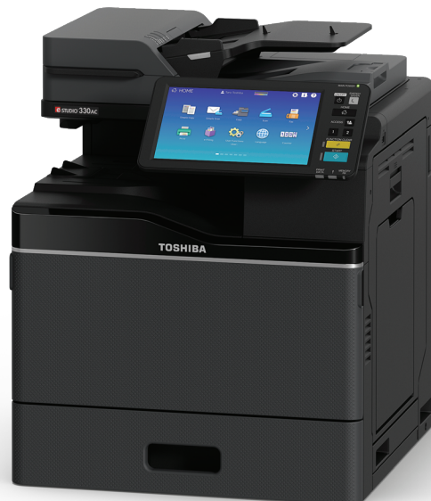
The e-STUDIO330AC/400AC Series is small enough for the desktop but big enough for the most demanding jobs with impressive features you'd expect to find on Toshiba's larger departmental MFPs.

This series not only has a compact footprint, but a compact carbon footprint. They are RoHS compliant, use recycled plastics, and have a Super Sleep (1W) Mode. They also reduce the environmental impact by being EPEAT Gold and Energy Star V 3.0 certified.