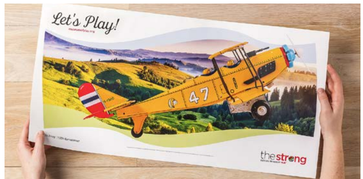
Extra-long sheet printing—maximum paper size 13 x 26" (330 x 660 mm)

It all adds up to better margins, higher profits and the ability to grow strategically with a single, future-proof investment.