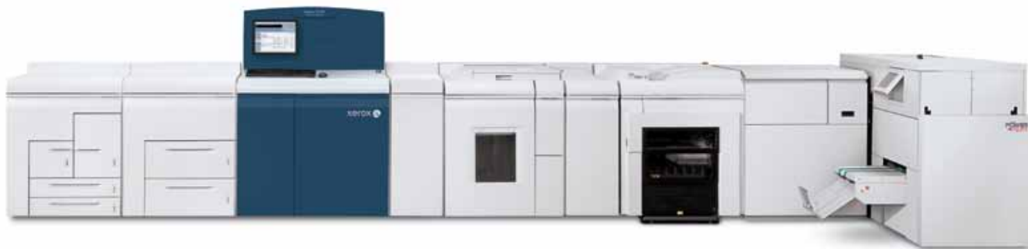
Xerox Nuvera® 157 EA Production System with Xerox® Production Stacker and Watkiss PowerSquare 200