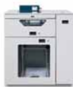
C.P. Bourg BSFx Dual-Mode Sheet Feeder