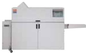
C.P. Bourg BDFNx Booklet Maker with Square Edge