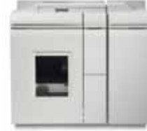
Basic Finisher Module Plus