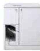
Xerox® Tape Binder