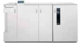
GBC FusionPunch II with Offset Stacker