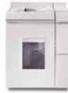
Basic Finisher Module