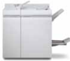
Multifunction Finisher Pro Plus