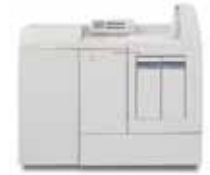
Xerox® DB120-D Document Binder