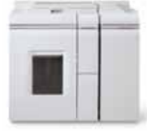
Basic Finisher Module – Direct Connect