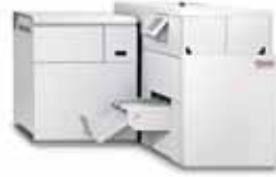
Watkiss PowerSquare 200