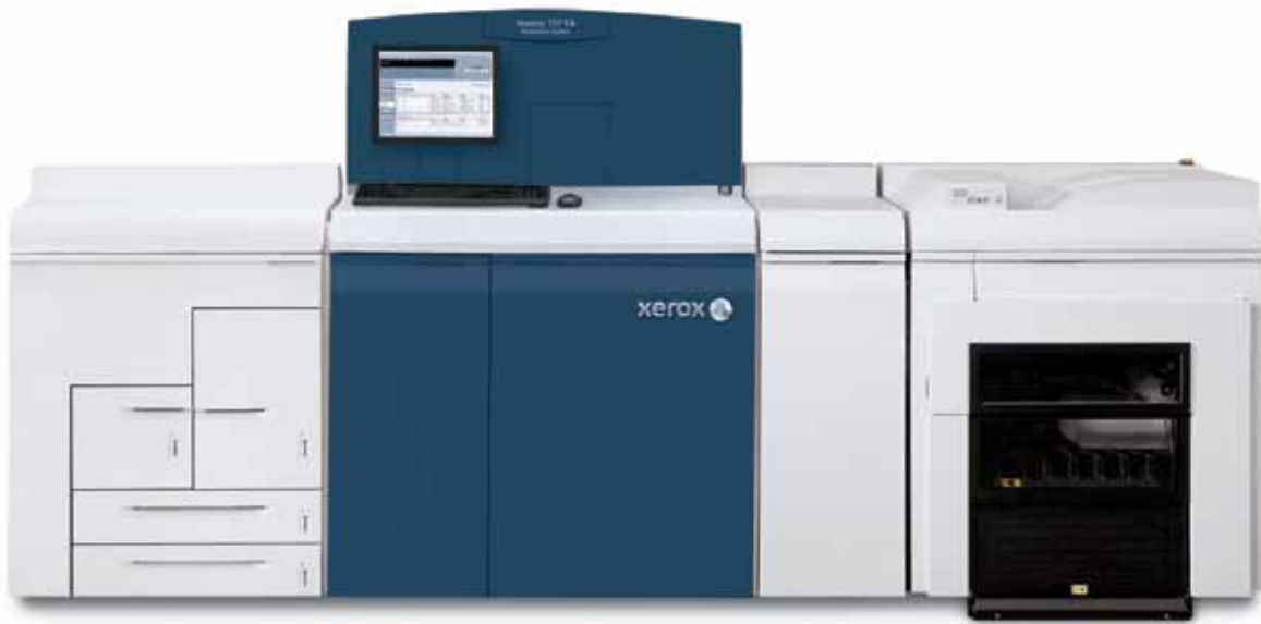
Xerox Nuvera® 157 EA Production System with Xerox® Production Stacker