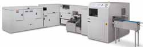
Xerox® Book Factory