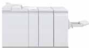
Plockmatic Pro 30 Booklet Maker (Available on 100/120/144/157 only)