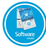
HP FlexiPRINT and CUT RIP