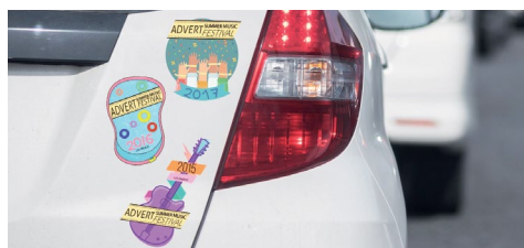
LABELS AND STICKERS