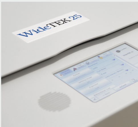
Large color touchscreen for simplified operation