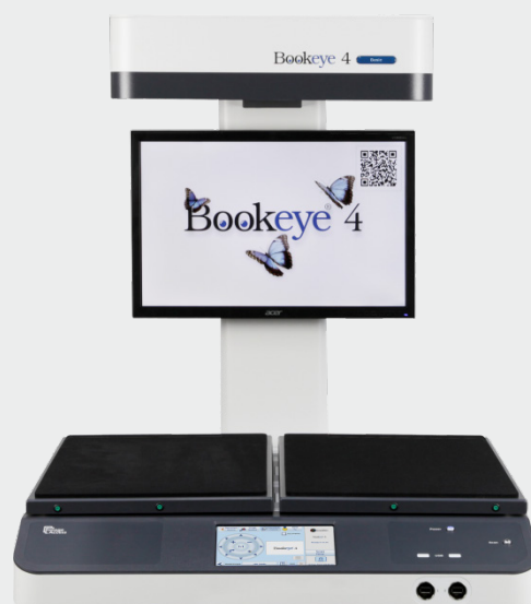
Front view of the Bookeye® 4 V2 Basic.