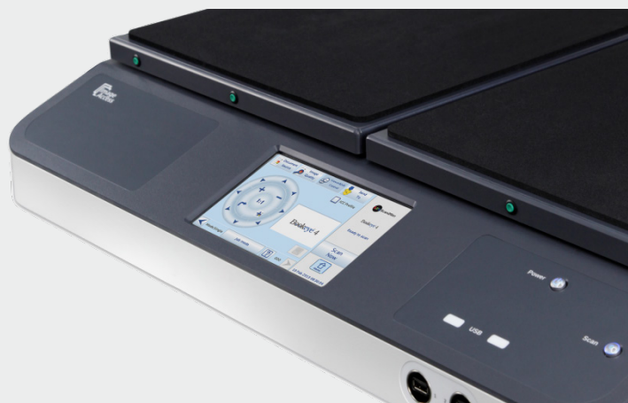
Large color touchscreen for simplified operation

If scanner requirements become more demanding over time, the Bookeye® 4 V2 Basic can be quickly and easily upgraded. This protects your investment while allowing you to add functionality, like software options or interfacing with Batch Scan Wizard or other capturing clients.