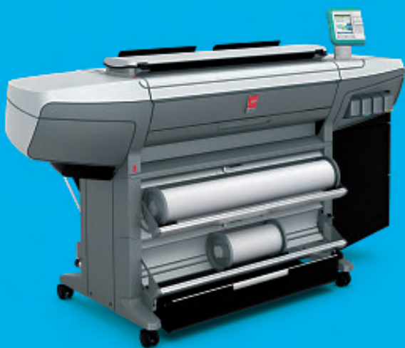
Océ ColorWave 300 R