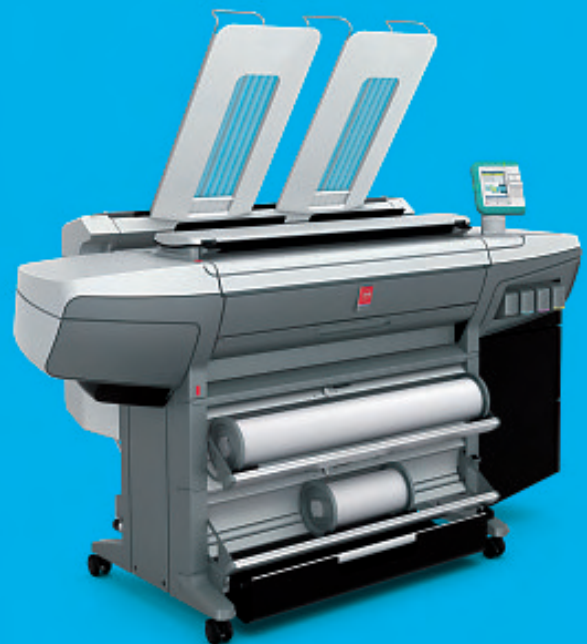
Océ ColorWave 300 T