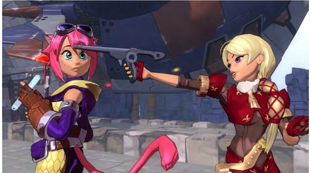
Blade Kitten.

Save time when modeling and maintain focus on the creative task at hand with a new in-context UI for polygon modeling tools that enables you to more interactively manipulate properties and enter values directly at the point of interest in the viewport.