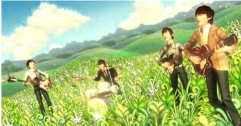
©2009, The Beatles: Rock Band. Image courtesy of Harmonix Music Systems, Inc.