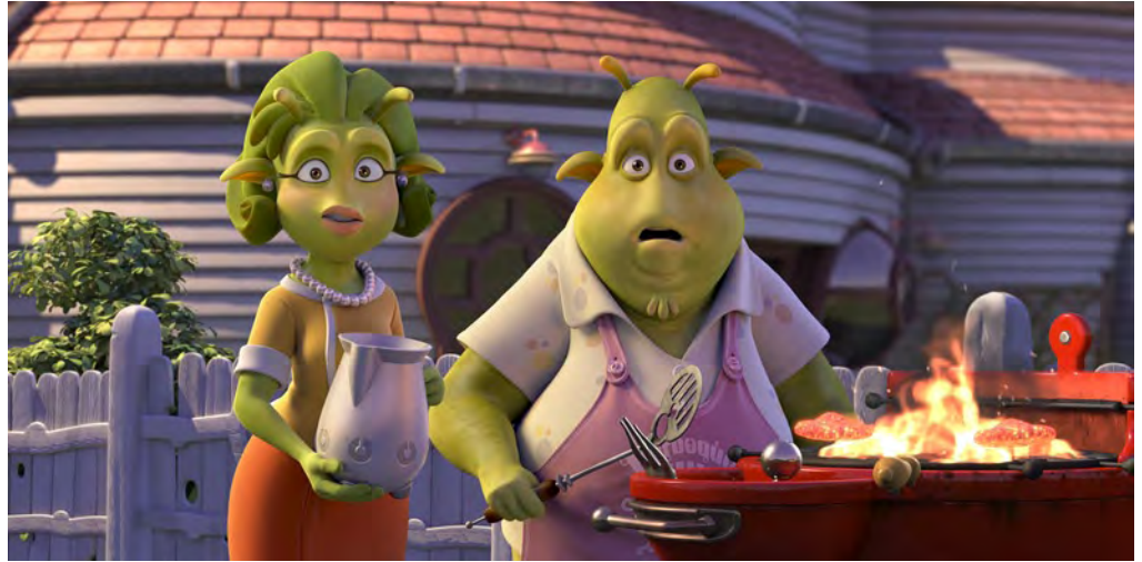
©2009, Planet 51.